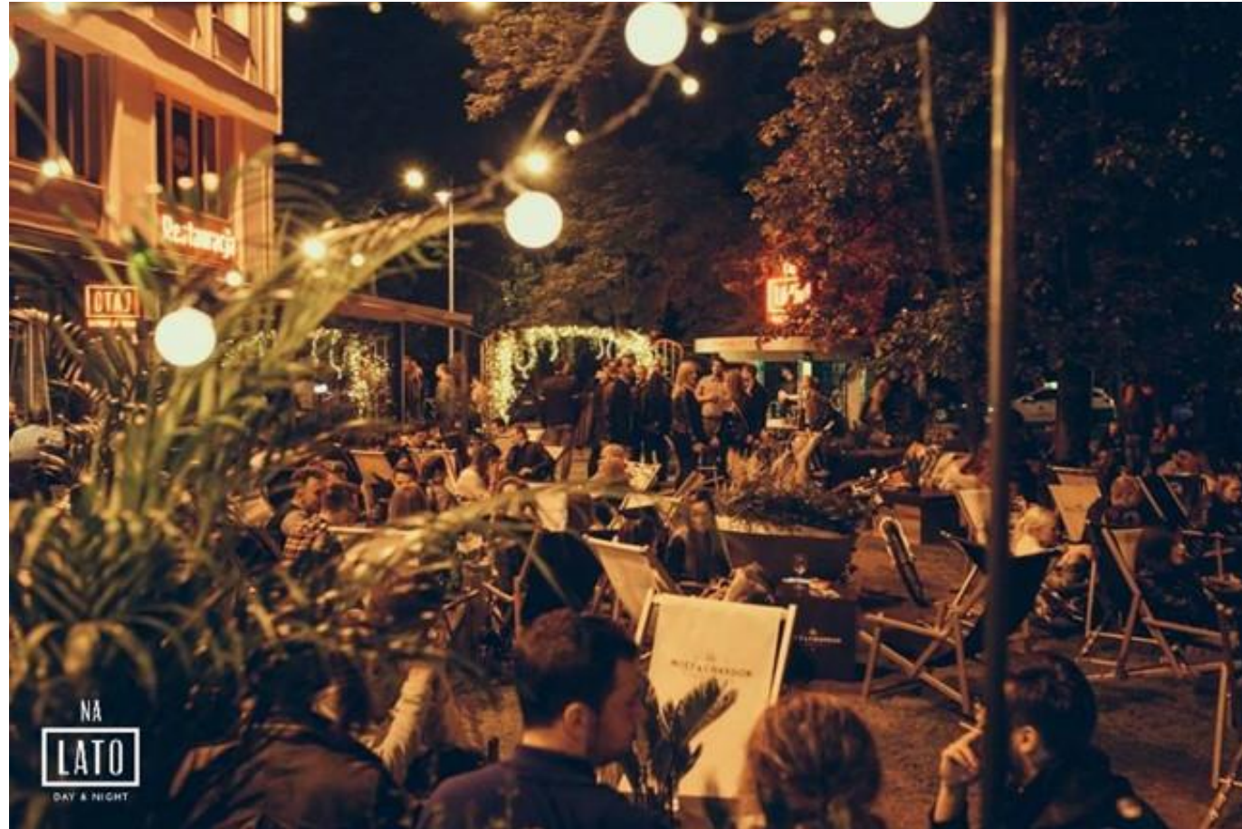
BAS Annual General Meeting, Warsaw, 25th of March 2022